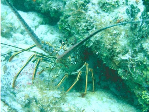
Hope you remember this spot come Lobster Season