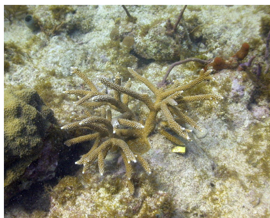
Before and after. Coral replanted by an ADA member, July 2008 and March 2010