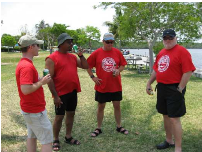
Apres-Dive Good Cheer