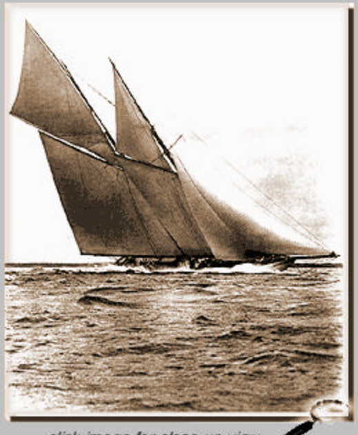
click image for close-up view