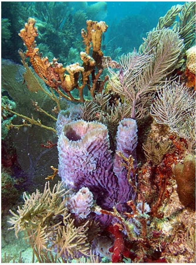
1st Príze Dígítal/Manual/Strobe Oly E20N Biscayne Underwater Park Níck Boyd