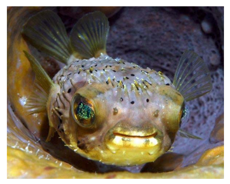
Puffer in Sponge By Nick Boyd