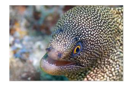
Thanks Nic for these Great Pictures!!!