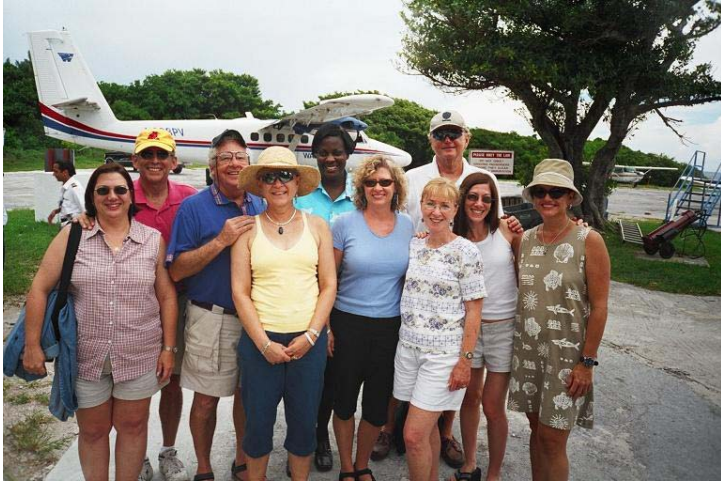
Some of the Happy Divers