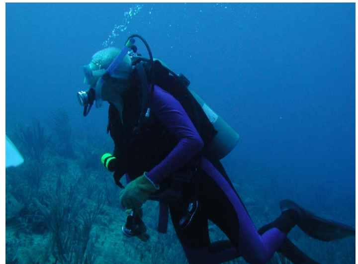
Our Most Senior Diver