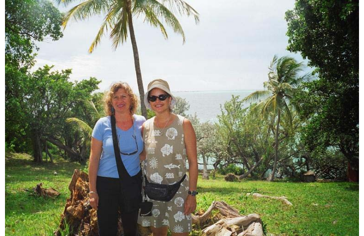
Two of the Happy Divers