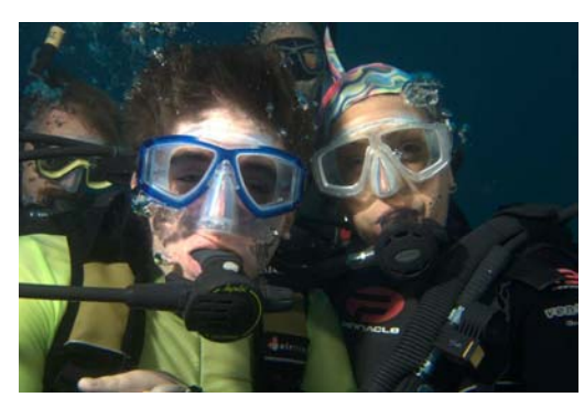
on Aug. 25th with DiveHeart