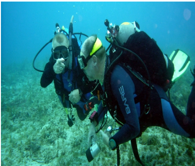
on 10/18/2009

Are you on Facebook? Join the ADA page here: http://www.facebook.com/ActiveDivers We can post your photos and share dive stories!